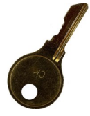
Metal Storage Core Change Key