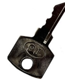
Metal Storage Master Key