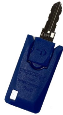
PL Laminate Master