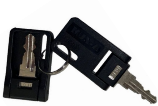
PL Laminate Standard Key Set