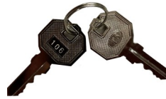
Metal Storage Standard Key Set