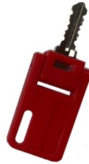
PL Laminate Core Removal