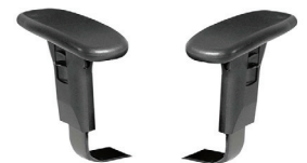
311AK – Optional, Height + Width Adjustable Arm Kit